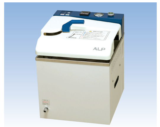
TR-24S (10 ℓ)