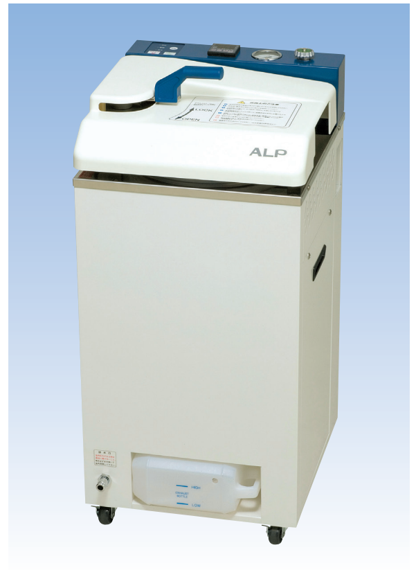
TR-24L (20 ℓ)

It can be customized for GMP specification.