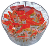
Stand-up pouch (180mm×140mm×30mm) 20 pcs./basket Total 60 pcs./operation