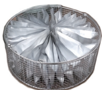
Non-stand-up pouch (Vertical placement) (180mm×140mm×20mm) 32 pcs./basket Total 96 pcs./operation