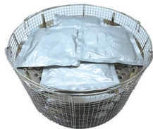
Non-stand-up pouch (Horizontal placement) (180mm×140mm×20mm) 20 pcs./basket Total 60 pcs./operation