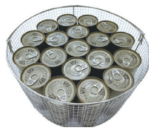
Steel can (φ75mm×110) 18 pcs./basket Total 54 pcs./operation